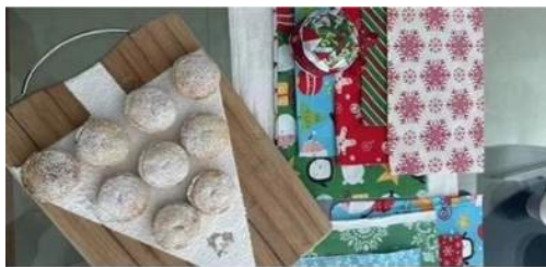
Christmas Bauble workshop 2023