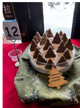
3 rd Place