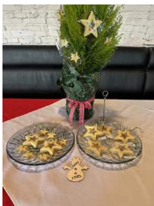
1 st Place

for 1 st , 2 nd and 3 rd places. Rebecca came 2 nd with her gingerbread cookies and Pam came 3 rd with her vegan chocolate & orange cookies.