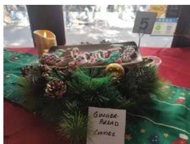
2 nd Place